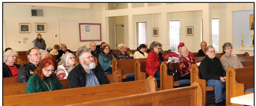
Chilly parishioners listen to reports and the presentation of the 2024 budget