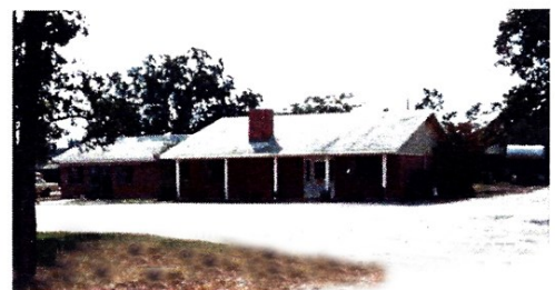
Walnut Creek Information Center - December 1977