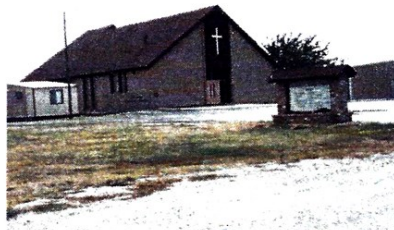
St. Jude's Catholic Church - 1977