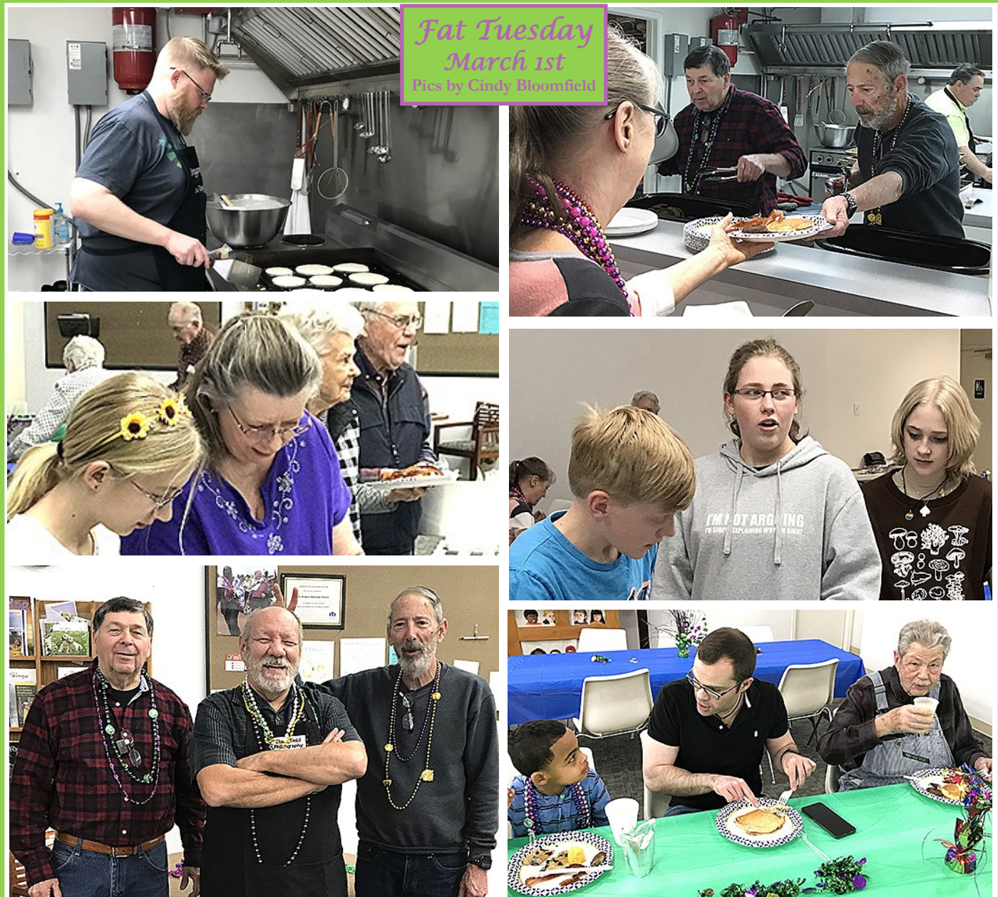
Fat Tuesday March 1st

Making Disciples of Jesus Christ for the Transformation of the World by Knowing, Loving and Serving God.