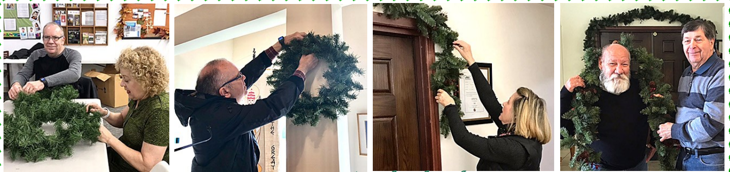
Greening the Church