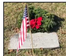
Wreaths Across America 2023